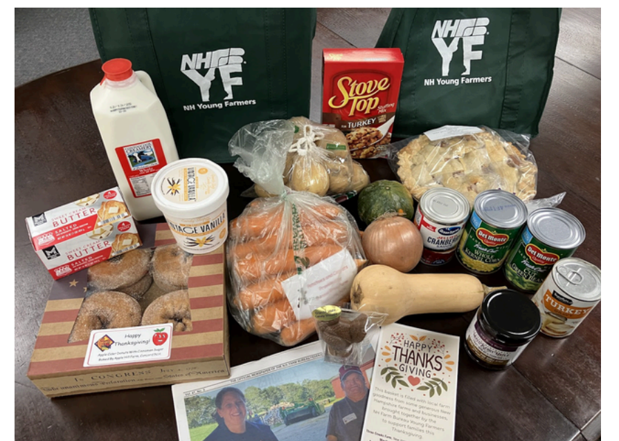
YF Thanksgiving Dinner Donations