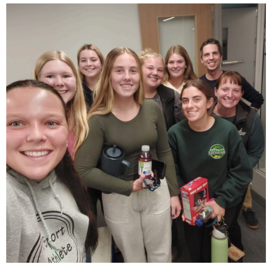
UNH Collegiate Farm Bureau Club