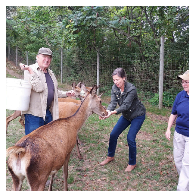
Congresswoman Goodlander visiting Bonnie Brae Farm-Grafton County