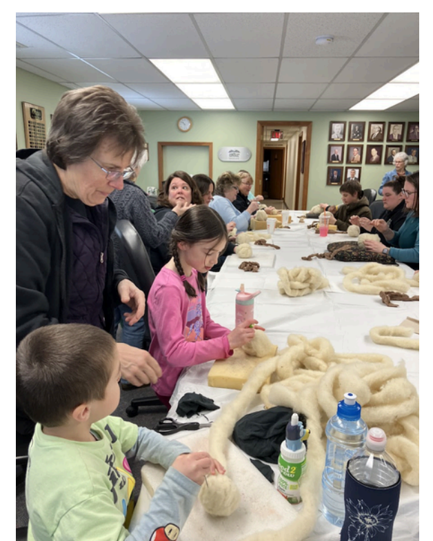
AW Dryer ball Workshop