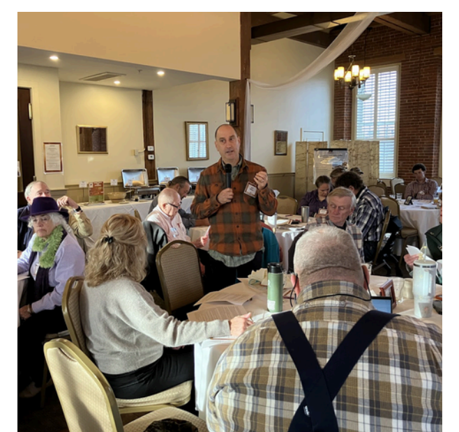
2025 NHFB Annual Meeting