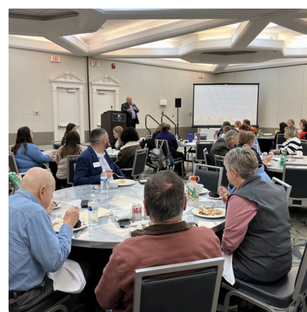
New England Leadership Conference, Nashua